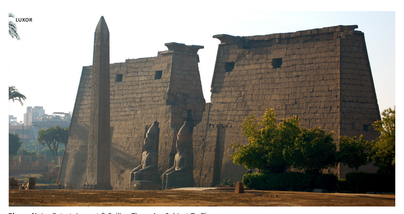
Please Note: Entertainment & Sailing Times Are Subject To Change.

Afternoon tea will be served on board. Next, your Egyptologist will guide you on a tour of the East Bank of Luxor to the strikingly graceful Temple of Luxor dedicated to the God Amun. Enjoy dinner on board, followed by a belly dancer and whirling dervish show.