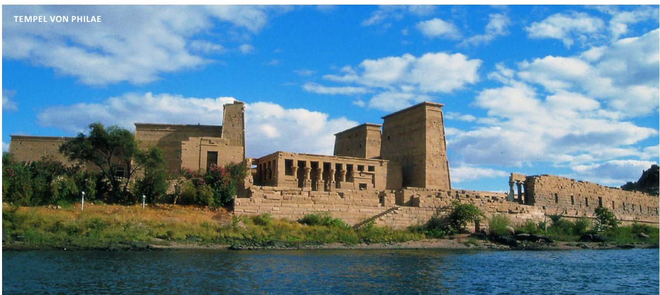
TEMPEL VON PHILAE

Tonight's farewell dinner will be a gala dinner (jacket required), with white-gloved waiters serving gourmet cuisine.