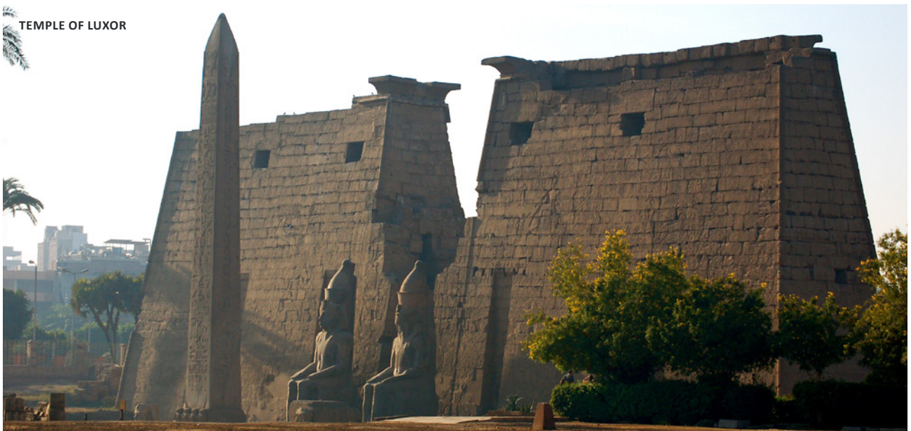
TEMPLE OF LUXOR

Please Note: Entertainment & Sailing Times Are Subject To Change.